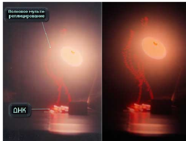
Figure 2: The picture shows the discrete replica like structure of the band like image interpreted by experimenters as replica image of DNA sample (first method).