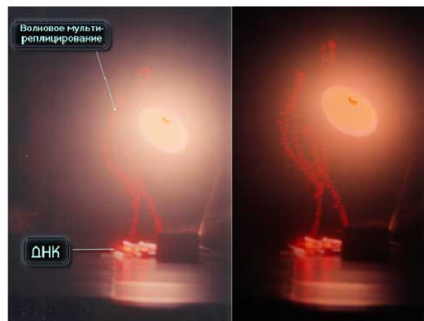
Figure 2: The picture shows the discrete replica like structure of the band like image interpreted by experimenters as replica image of DNA sample (first method).

replicas they would emanate directly from the instruments. In the case of DNA image they would emanate from a position to the left from the cell containing DNA. The presence of DNA should somehow generate the flux tubes.