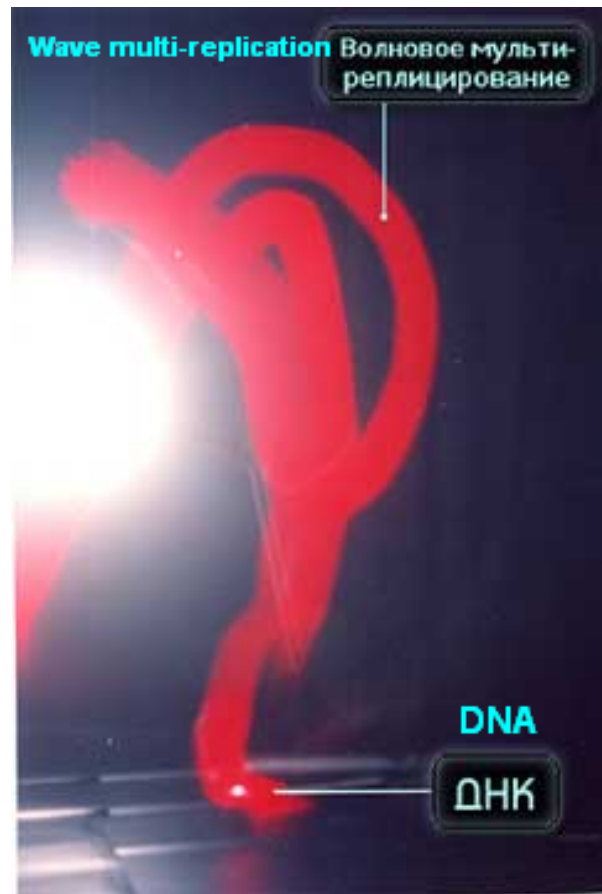
Figure 3: The picture reveals the 5-fold fine structure of the band like image interpreted by experimenters as replica image of DNA sample. The 5-fold character probably correspond to five red LEDs above the sample (second method).